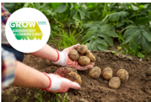
Apply for the 2021 GROW Summer School