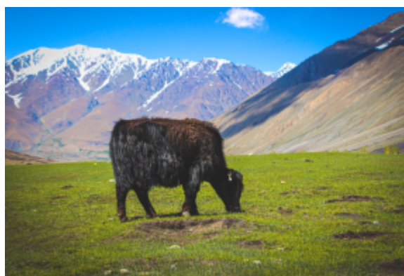
Identification of global priorities for new mountain protected and conserved areas